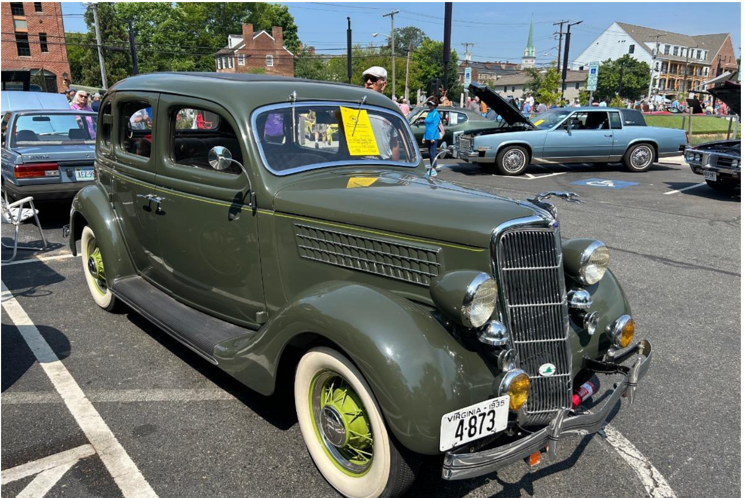
A few of the cars at 66 th Annual HFR Show on 3 June.