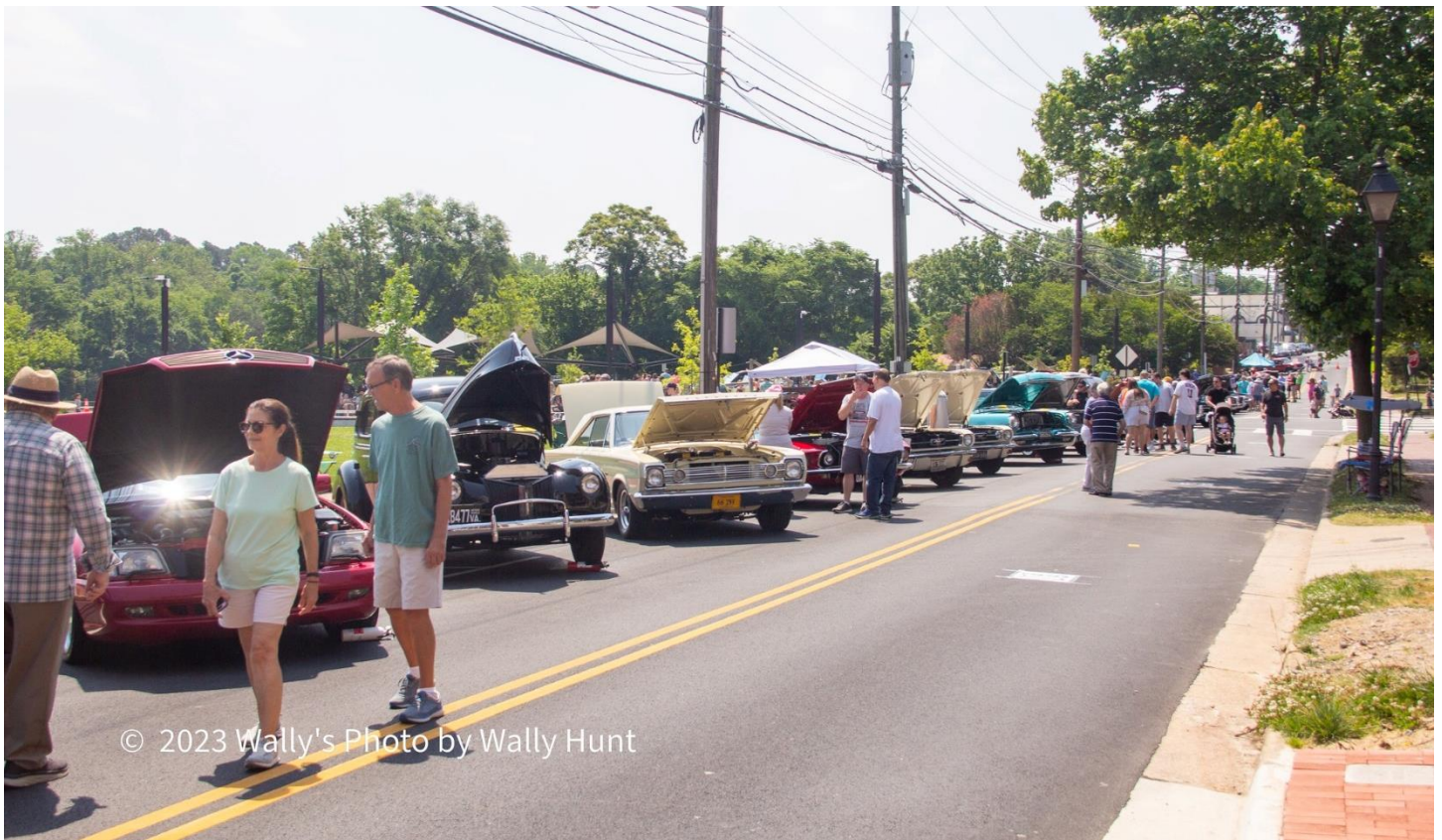
Wally's photos: HFR car show 3 June.